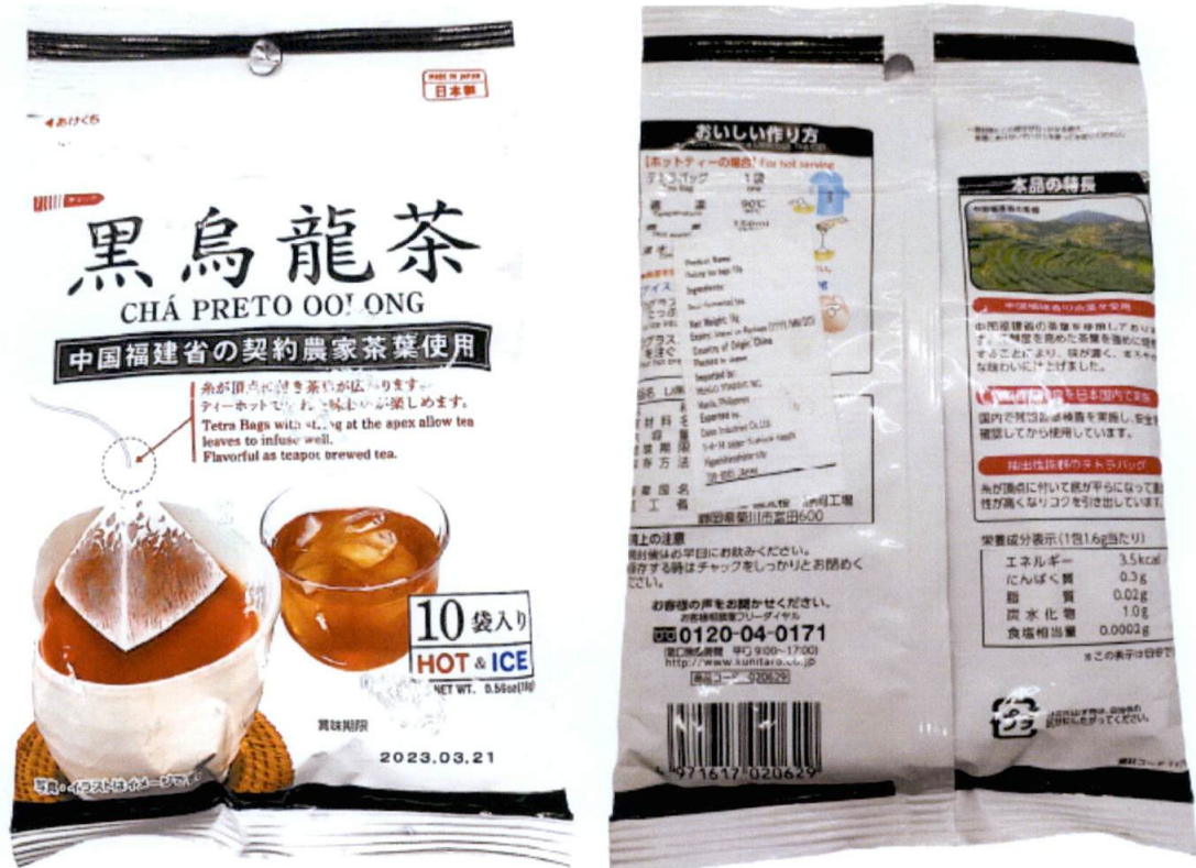
Figure 1. Unregistered CHA PRETO OOLONG Oolong Tea Bags

The Food and Drug Administration (FDA) warns all healthcare professionals and the general public NOT TO PURCHASE AND CONSUME the unregistered food product: