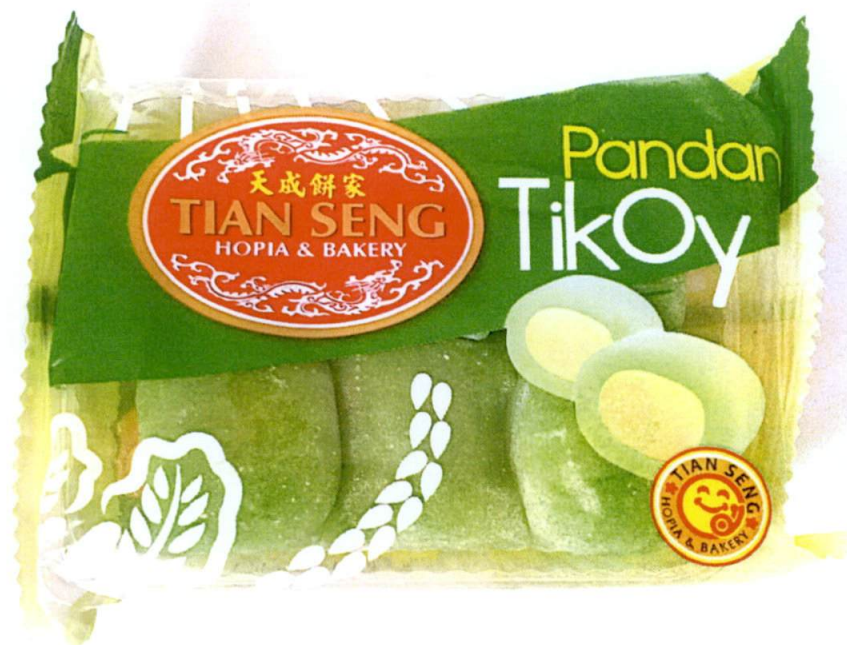
Figure 1. Unregistered TIAN SENG HOPIA & BAKERY Tikoy Pandan

The Food and Drug Administration (FDA) warns all healthcare professionals and the general public NOT TO PURCHASE AND CONSUME the unregistered food product: