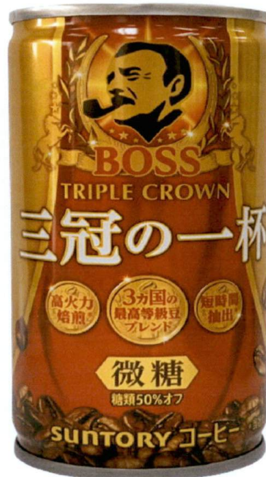
Figure 1. Unregistered SUNTORY Boss Triple Crown Drink (In Foreign Language)

The Food and Drug Administration (FDA) warns all healthcare professionals and the general public NOT TO PURCHASE AND CONSUME the unregistered food product: