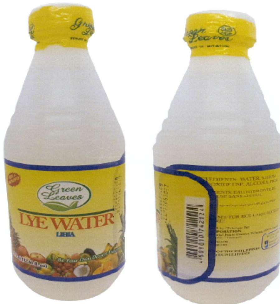
Figure 1. Unregistered GREEN LEAVES Lye Water

The Food and Drug Administration (FDA) warns all healthcare professionals and the general public NOT TO PURCHASE AND CONSUME the unregistered food product: