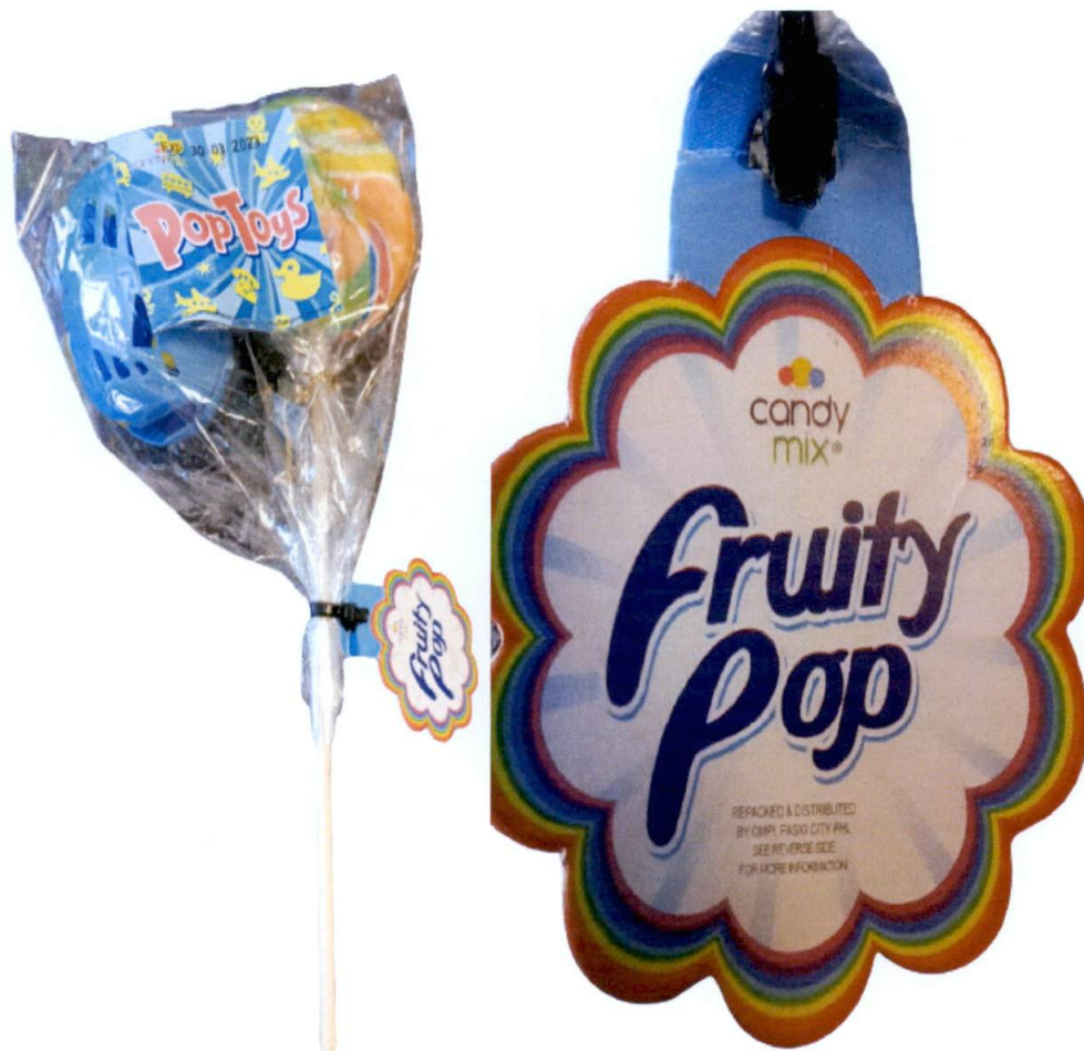
Figure 1. Unregistered CANDY MIX FRUITY POP PopToys

The Food and Drug Administration (FDA) warns all healthcare professionals and the general public NOT TO PURCHASE AND CONSUME the unregistered food product: