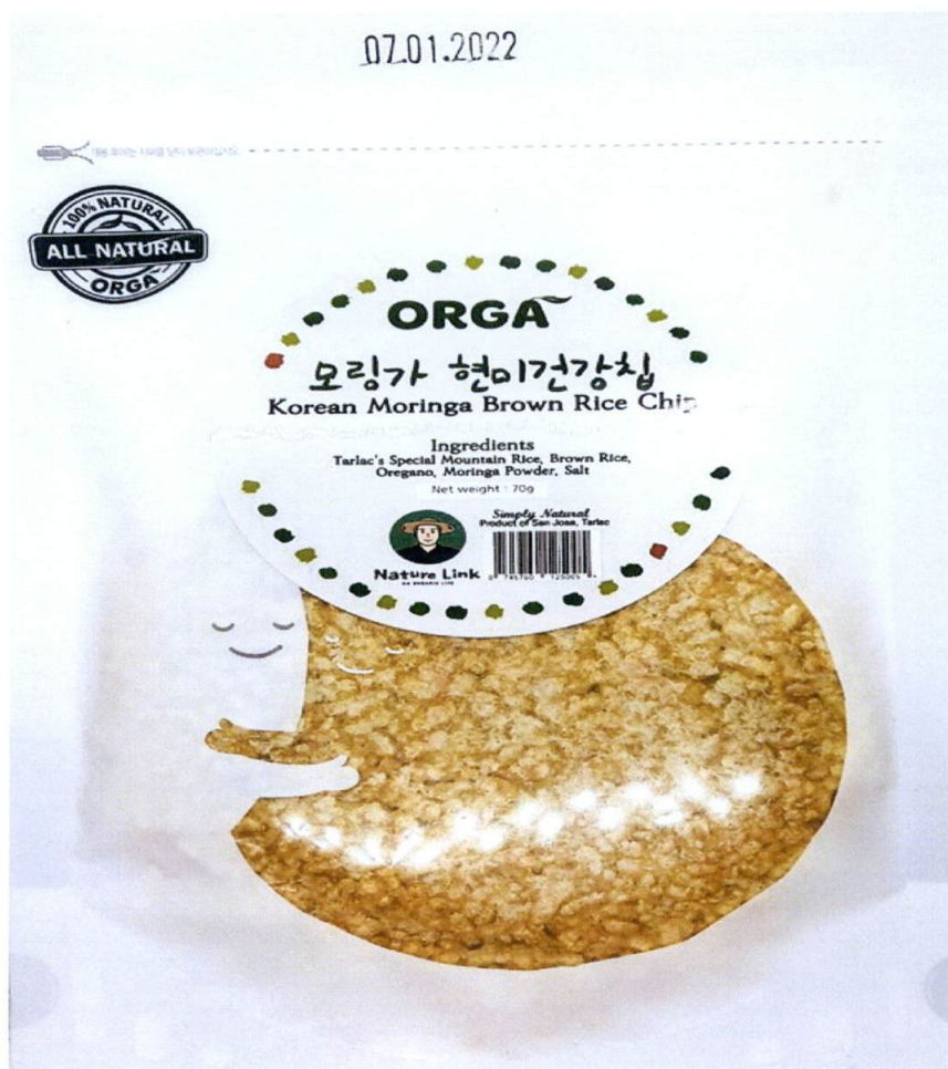
Figure 1. Unregistered ORGA Korean Moringa Brown Rice Chip

The Food and Drug Administration (FDA) warns all healthcare professionals and the general public NOT TO PURCHASE AND CONSUME the unregistered food product: