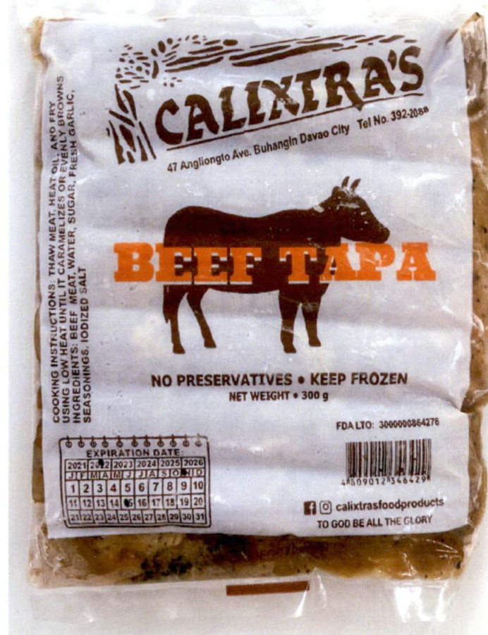
Figure 1. Unregistered CALIXTRA'S Beef Tapa

The Food and Drug Administration (FDA) warns all healthcare professionals and the general public NOT TO PURCHASE AND CONSUME the unregistered food product: