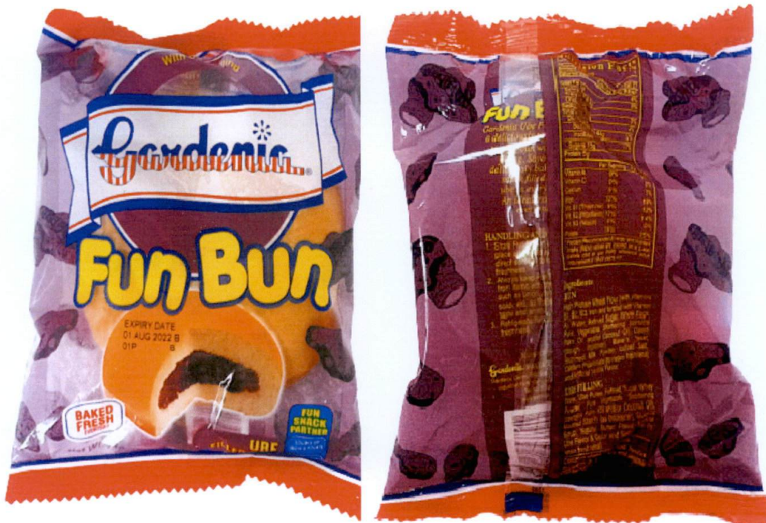
Figure 1. Unregistered GARDENIA Fun Bun - Ube Filled Bun

The Food and Drug Administration (FDA) warns all healthcare professionals and the general public NOT TO PURCHASE AND CONSUME the unregistered food product: