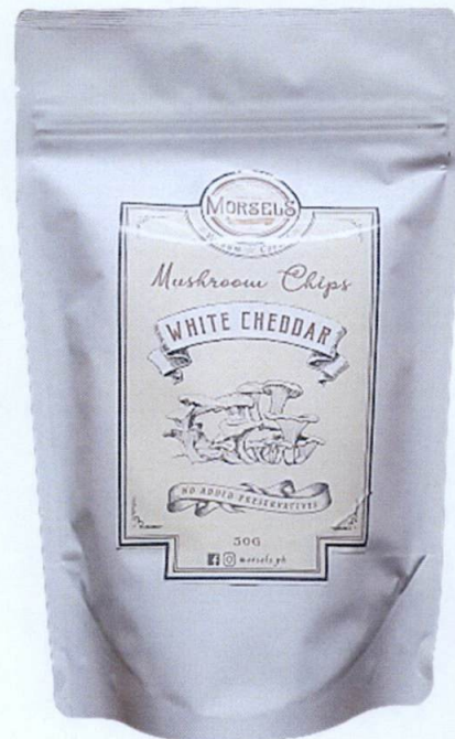
Figure 4. Unregistered MORFELS HEALTHY SNACKS Mushroom Chips White Cheddar