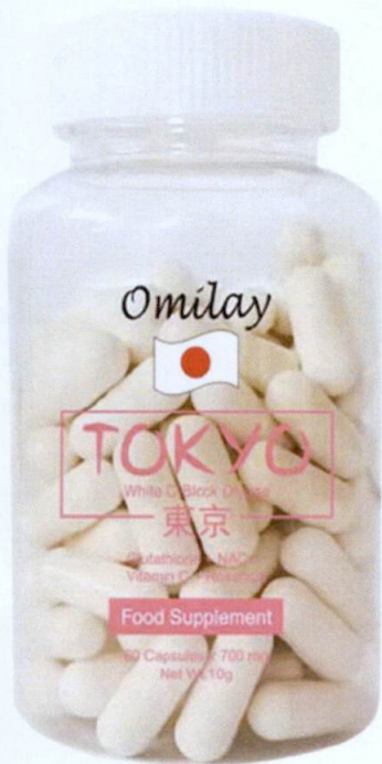
Figure 4. Unregistered OMILAY TOKYO White C-Block Dfyage Glutathione + NAC + Vitamin C + Rosehips Food Supplement