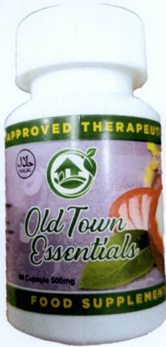
Figure 2. Unregistered OLD TOWN ESSENTIALS Food Supplement