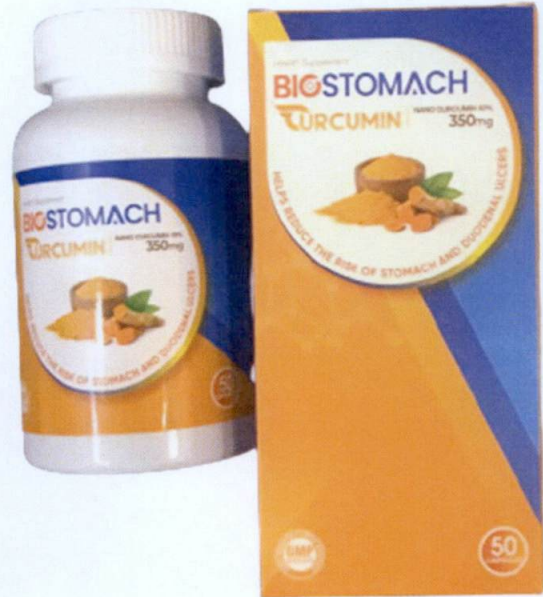
Figure 3. Unregistered BIOSTOMACH Turcumin Nano Curcumin