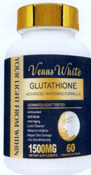
Figure 1. Unregistered VENUS WHITE Glutathione Dietary Supplement

The Food and Drug Administration (FDA) warns all healthcare professionals and the general public NOT TO PURCHASE AND CONSUME the following unregistered food supplements and food products: