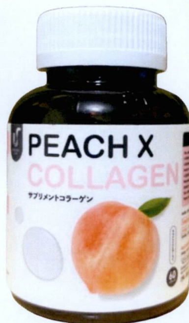
Figure 5. Unregistered UNBRANDED Peach Collagen