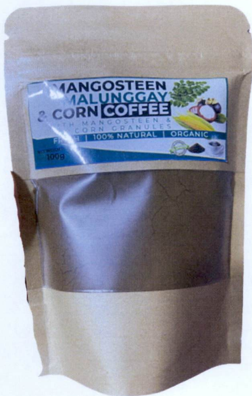
Figure 2. Unregistered UNBRANDED Mangosteen Malunggay & Corn Coffee