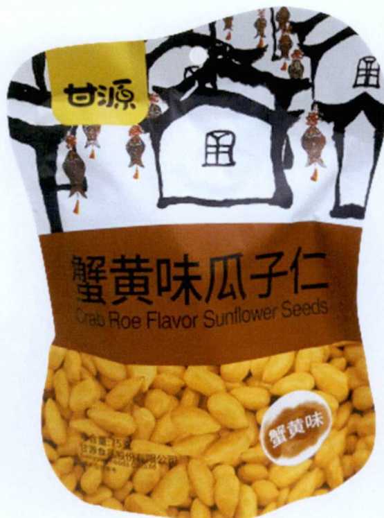
Figure 3. Unregistered Crab Roe Flavor Sunflower Seeds (In Foreign Language)