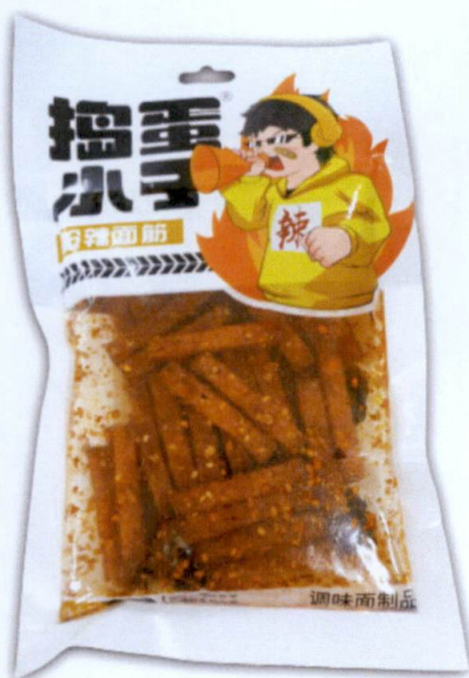
Figure 4. Unregistered Assumed as Meat Product (In Foreign Language)