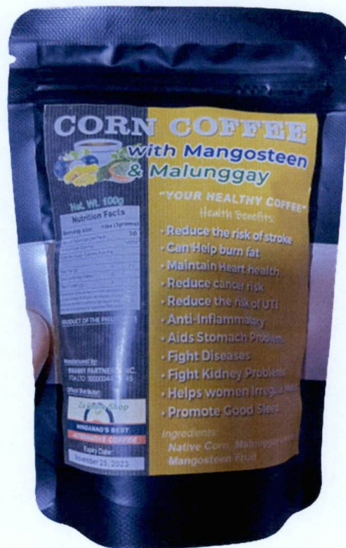
Figure 1. Unregistered UNBRANDED Corn Coffee with Mangosteen & Malunggay

The Food and Drug Administration (FDA) warns all healthcare professionals and the general public NOT TO PURCHASE AND CONSUME the following unregistered food products and food supplement: