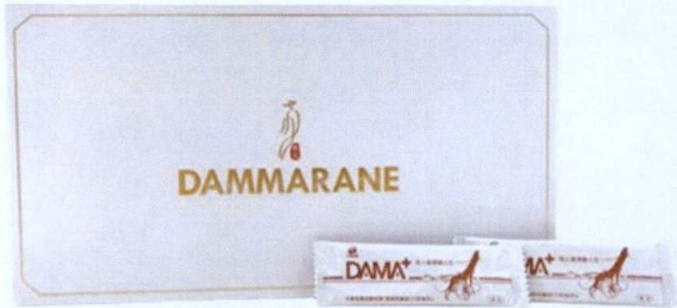
Figure 2. Unregistered EOSTRE Dammarane