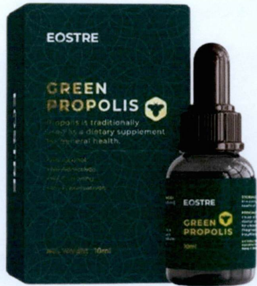
Figure 3. Unregistered EOSTRE Green Propolis