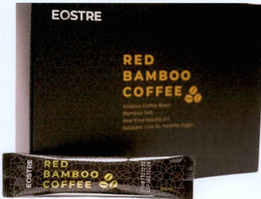
Figure 1. Unregistered EOSTRE Red Bamboo Coffee

The Food and Drug Administration (FDA) warns all healthcare professionals and the general public NOT TO PURCHASE AND CONSUME the following unregistered food supplements and food products: