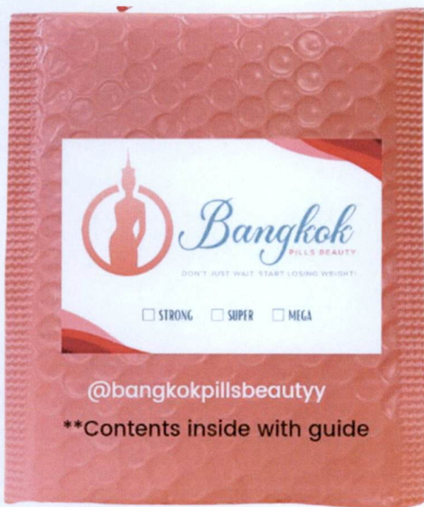
Figure 4. Unregistered BANGKOK Pills Beauty