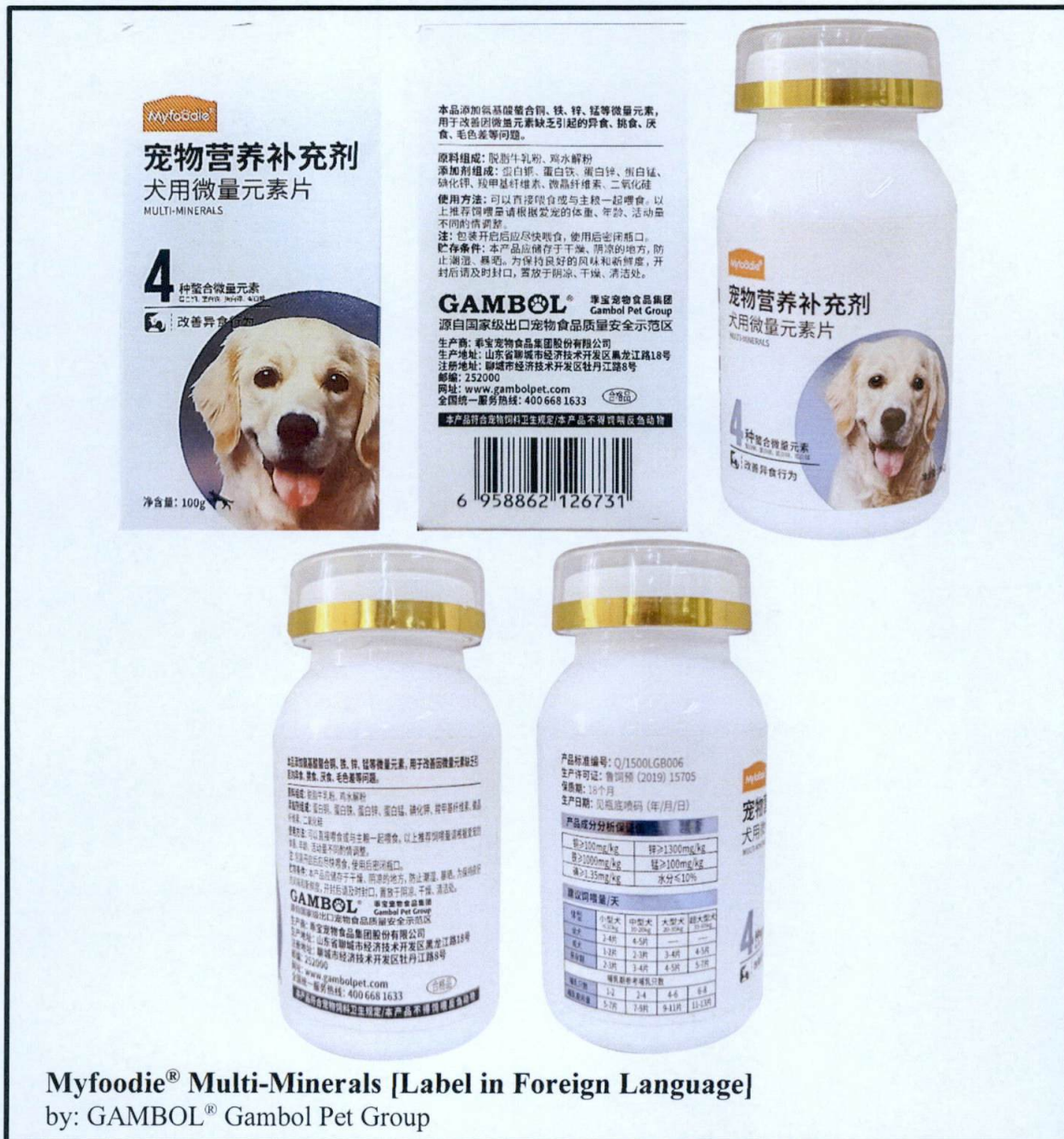
Figure 1: Unregistered drug product

The Food and Drug Administration (FDA) advises the public against the purchase and use of the unregistered veterinary drug product: