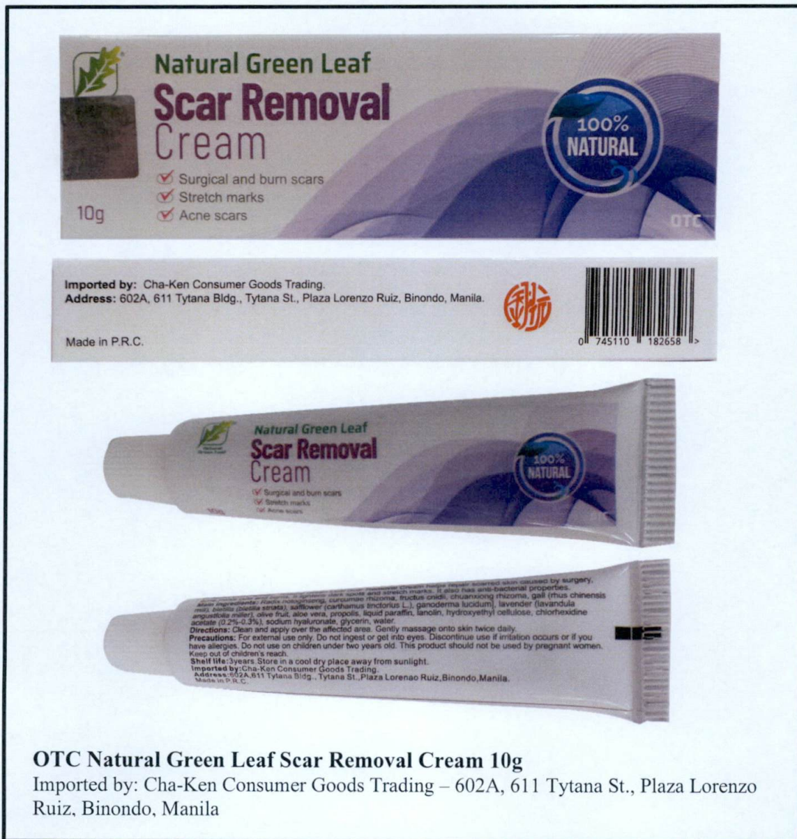
Figure 1: Unregistered drug product

The Food and Drug Administration (FDA) advises the public against the purchase and use of the unregistered drug product: