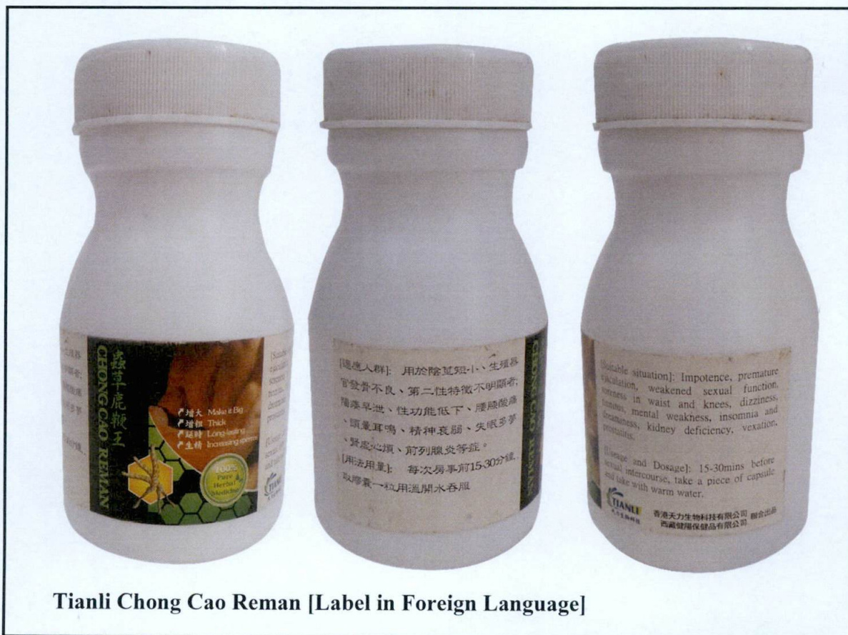
Tianli Chong Cao Reman [Label in Foreign Language]