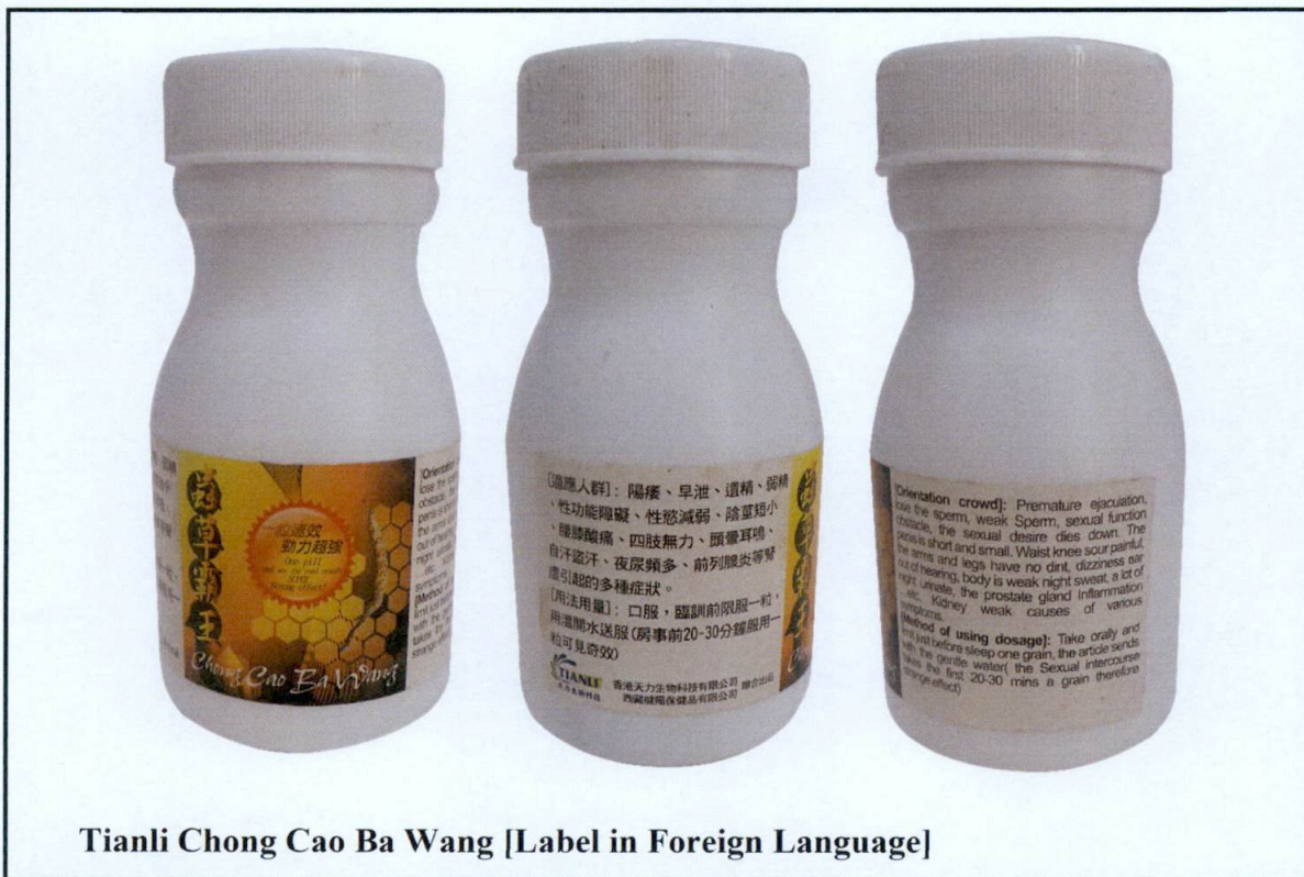
Tianli Chong Cao Ba Wang [Label in Foreign Language]