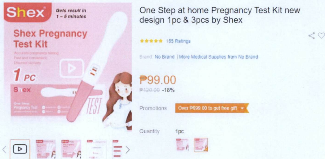
Figure 1. Unregistered Shex Pregnancy Test Kit advertised at Lazada.com.ph

The Food and Drug Administration (FDA) warns all healthcare professionals and the general public NOT TO PURCHASE AND USE the unregistered medical device product: