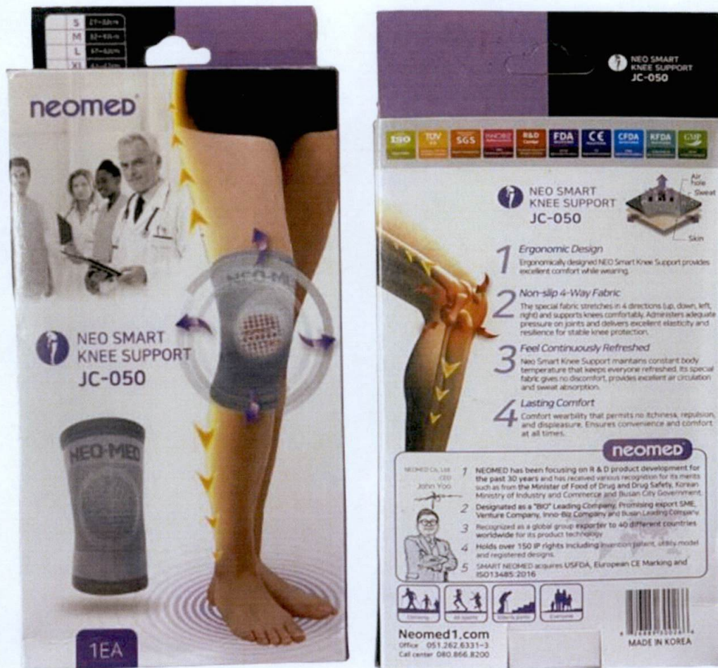
Figure 2. Unnotified NEOMED® Neo Smart Knee Support JC-050

The FDA verified through post-marketing surveillance that the above-mentioned medical device products are not notified and no corresponding Product Notification Certificates have been issued. Pursuant to the Republic Act No. 9711, otherwise known as the “Food and Drug Administration Act of 2009”, the manufacture, importation, exportation, sale, offering for sale, distribution, transfer, non-consumer use, promotion, advertising or sponsorship of health products without the proper authorization is prohibited.