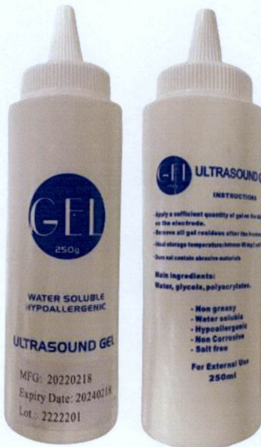
Figure 1. Unnotified GEL Water Soluble Hypoallergenic Ultrasound Gel 250g

The Food and Drug Administration (FDA) warns all healthcare professionals and the general public NOT TO PURCHASE AND USE the unnotified medical device products: