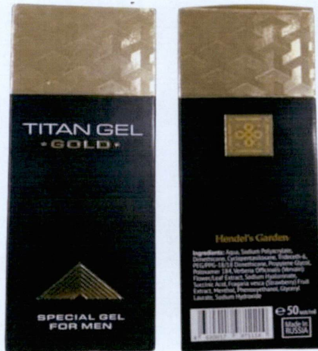
Figure 1. Unnotified Titan Gel Gold

The Food and Drug Administration (FDA) warns all healthcare professionals and the general public NOT TO PURCHASE AND USE the unnotified medical device product: