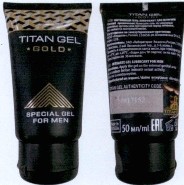
Figure 2. Unnotified Titan Gel Gold

The FDA verified through post-marketing surveillance that the abovementioned medical device product is not notified and no corresponding Product Notification Certificate has been issued. Pursuant to the Republic Act No. 9711, otherwise known as the “Food and Drug Administration Act of 2009”, the manufacture, importation, exportation, sale, offering for sale, distribution, transfer, non-consumer use, promotion, advertising or sponsorship of health products without the proper authorization is prohibited.