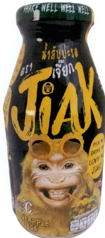
Figure 1. Unregistered JIAK Pineapple Juice

The Food and Drug Administration (FDA) warns all healthcare professionals and the general public NOT TO PURCHASE AND CONSUME the unregistered food product: