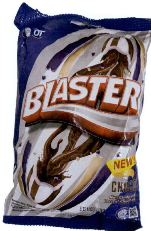
Figure 1. Unregistered BLASTER CHOCO Mint Candy with Blast of Chocolate

The Food and Drug Administration (FDA) warns all healthcare professionals and the general public NOT TO PURCHASE AND CONSUME the unregistered food product: