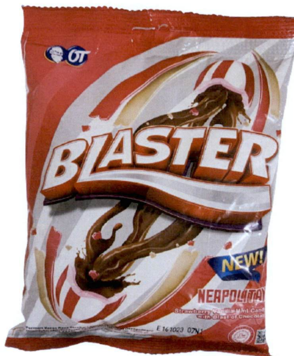
Figure 1. Unregistered BLASTER NEAPOLITAN Strawberry Vanilla Mint Candy with Blast of Chocolate

The Food and Drug Administration (FDA) warns all healthcare professionals and the general public NOT TO PURCHASE AND CONSUME the unregistered food product: