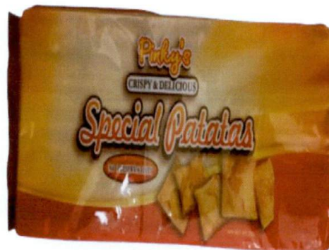
Figure 1. Unregistered PINKY'S CRISPY DELICIOUS Special Patatas

The Food and Drug Administration (FDA) warns all healthcare professionals and the general public NOT TO PURCHASE AND CONSUME the unregistered food product: