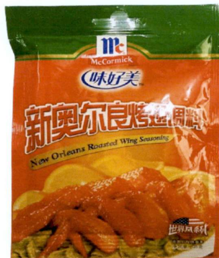
Figure 1. Unregistered MC CORMICK New Orleans Roasted Wing Seasoning

The Food and Drug Administration (FDA) warns all healthcare professionals and the general public NOT TO PURCHASE AND CONSUME the unregistered food product: