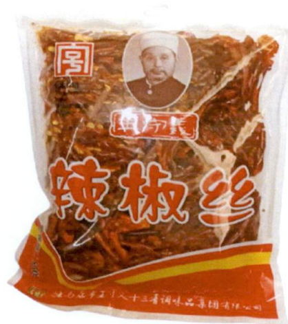
Figure 1. Unregistered CHINA TIME HONORED BRAND Product Name in Foreign Language

The Food and Drug Administration (FDA) warns all healthcare professionals and the general public NOT TO PURCHASE AND CONSUME the unregistered food product: