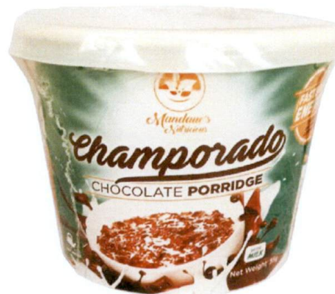
Figure 1. Unregistered MANDAUE'S NUTRICIOUS Champorado Chocolate Porridge

The Food and Drug Administration (FDA) warns all healthcare professionals and the general public NOT TO PURCHASE AND CONSUME the unregistered food product: