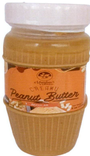
Figure 1. Unregistered MANDAUE'S NUTRICIOUS Creamy Peanut Butter Regular

The Food and Drug Administration (FDA) warns all healthcare professionals and the general public NOT TO PURCHASE AND CONSUME the unregistered food product: