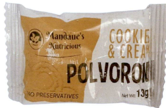
Figure 1. Unregistered MANDAUE'S NUTRICIOUS Cookies & Cream Polvoron

The Food and Drug Administration (FDA) warns all healthcare professionals and the general public NOT TO PURCHASE AND CONSUME the unregistered food product: