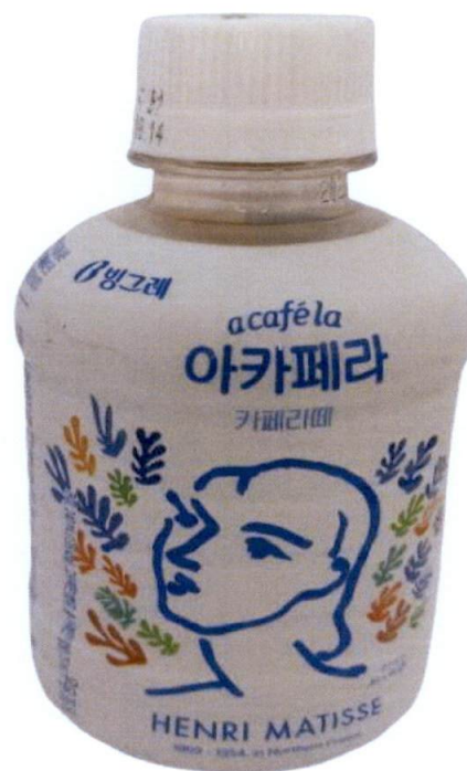
Figure 1. Unregistered BRAND NAME IN FOREIGN LANGUAGE CAFE LA HENRI MATISSE

The Food and Drug Administration (FDA) warns all healthcare professionals and the general public NOT TO PURCHASE AND CONSUME the unregistered food product: