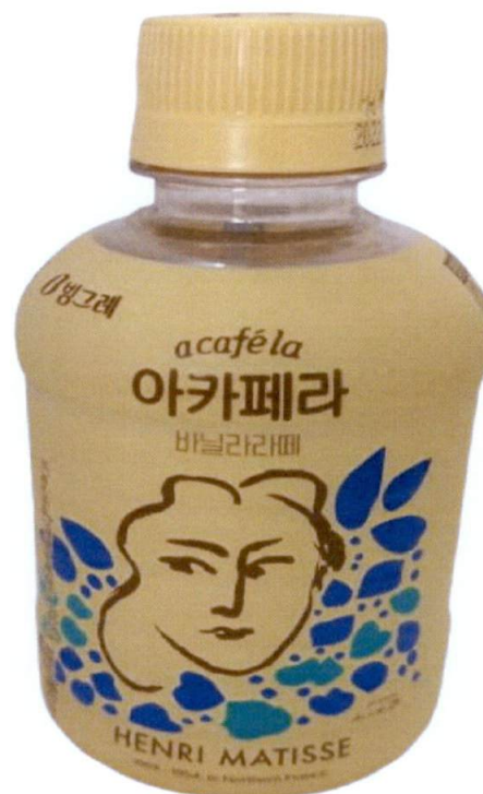
Figure 1. Unregistered ACAFELA HENRI MATISSE

The Food and Drug Administration (FDA) warns all healthcare professionals and the general public NOT TO PURCHASE AND CONSUME the unregistered food product: