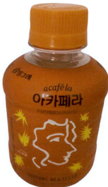
Figure 1. Unregistered ACAFELA HENRI MATISSE Drip Latte

The Food and Drug Administration (FDA) warns all healthcare professionals and the general public NOT TO PURCHASE AND CONSUME the unregistered food product: