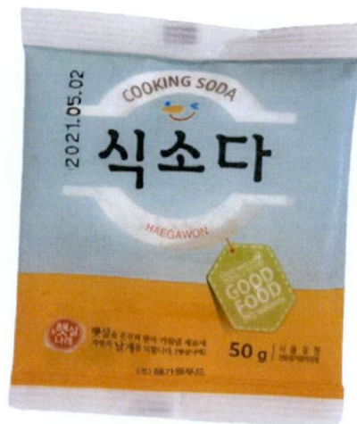
Figure 1. Unregistered HAEGAWON Cooking Soda in Plastic Pouch with Bluegreen and Orange Color (In foreign language)

The Food and Drug Administration (FDA) warns all healthcare professionals and the general public NOT TO PURCHASE AND CONSUME the unregistered food product: