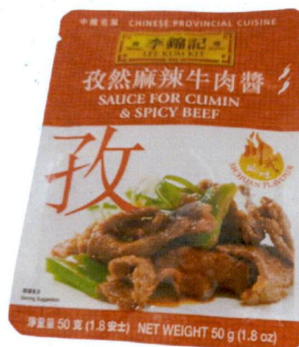
Figure 1. Unregistered LEE KUM KEE SAUCE FOR CUMIN & SPICY BEEF

The Food and Drug Administration (FDA) warns all healthcare professionals and the general public NOT TO PURCHASE AND CONSUME the unregistered food product: