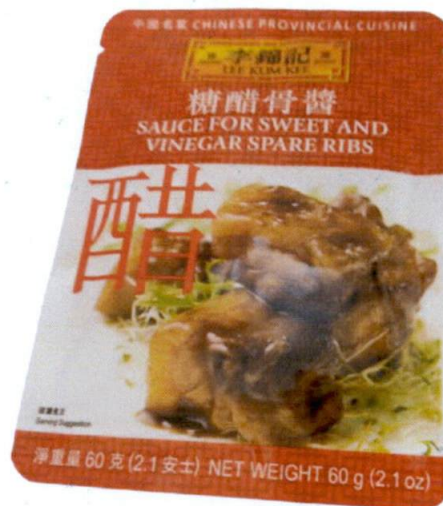
Figure 1. Unregistered LEE KUM KEE SAUCE FOR SWEET AND VINEGAR SPARE RIBS

The Food and Drug Administration (FDA) warns all healthcare professionals and the general public NOT TO PURCHASE AND CONSUME the unregistered food product: