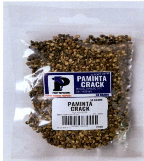
Figure 1. Unregistered PRECY REPACKING PAMINTA CRACK

The Food and Drug Administration (FDA) warns all healthcare professionals and the general public NOT TO PURCHASE AND CONSUME the unregistered food product: