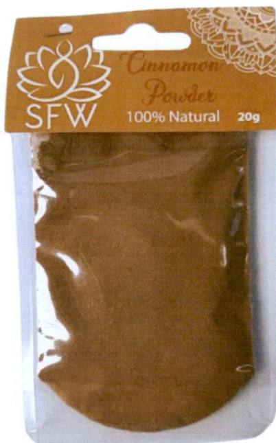
Figure 1. Unregistered SFW Cinnamon Powder

The Food and Drug Administration (FDA) warns all healthcare professionals and the general public NOT TO PURCHASE AND CONSUME the unregistered food product: