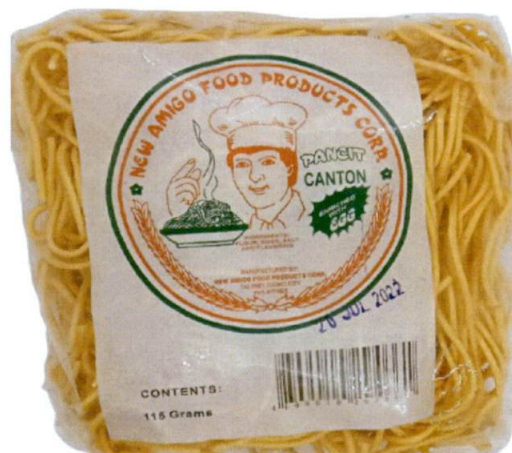
Figure 1. Unregistered NEW AMIGO FOOD PRODUCTS CORP. PANCIT CANTON

The Food and Drug Administration (FDA) warns all healthcare professionals and the general public NOT TO PURCHASE AND CONSUME the unregistered food product: