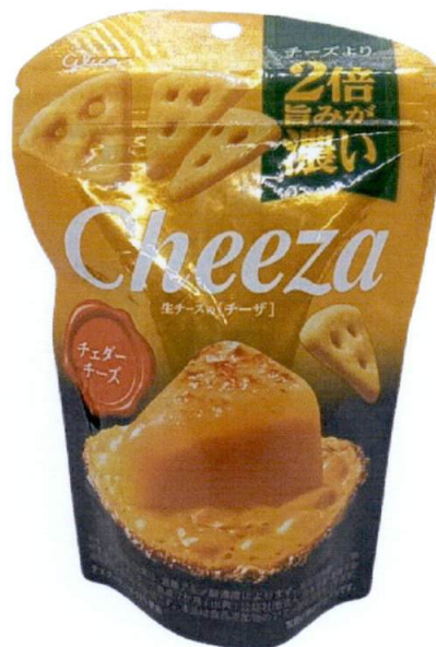
Figure 1. Unregistered GLICO CHEEZA OF RAW CHEESE CHEDDAR CHEESE

The Food and Drug Administration (FDA) warns all healthcare professionals and the general public NOT TO PURCHASE AND CONSUME the unregistered food product: