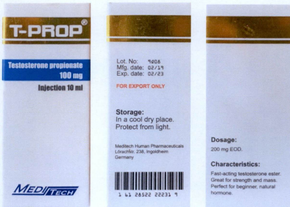
T-Prop® Testosterone Propionate 100 mg Injection 10 mL by: MEDITECH Human Pharmaceuticals - Lorachstr, 238, Ingoldheim Germany