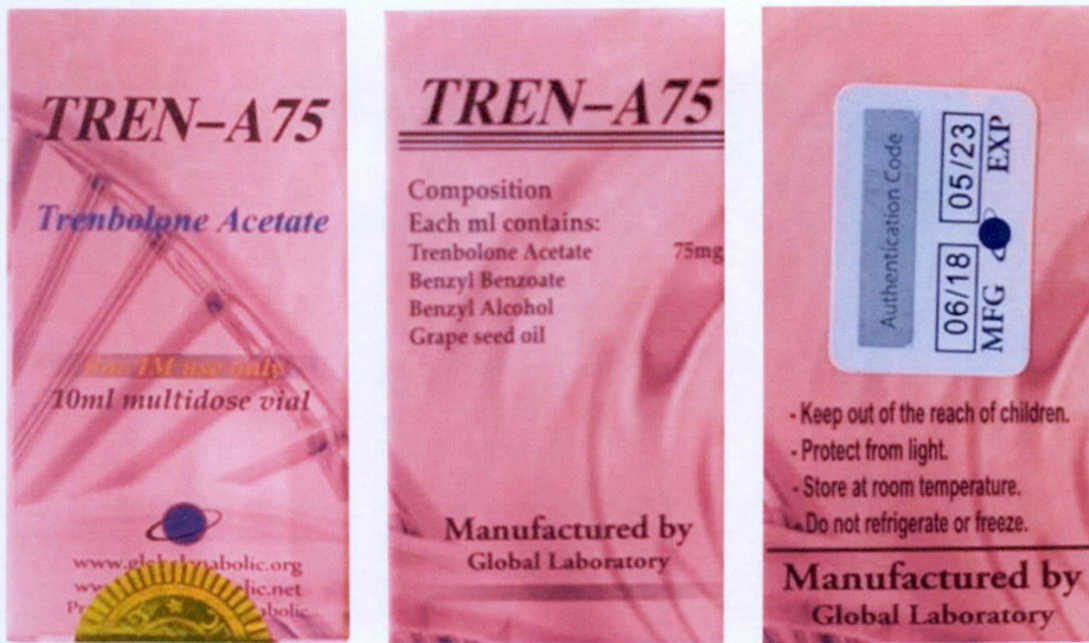
Tren-A75 Trenbolone Acetate 10 mL Multidose Vial Manufactured by: Global Laboratory