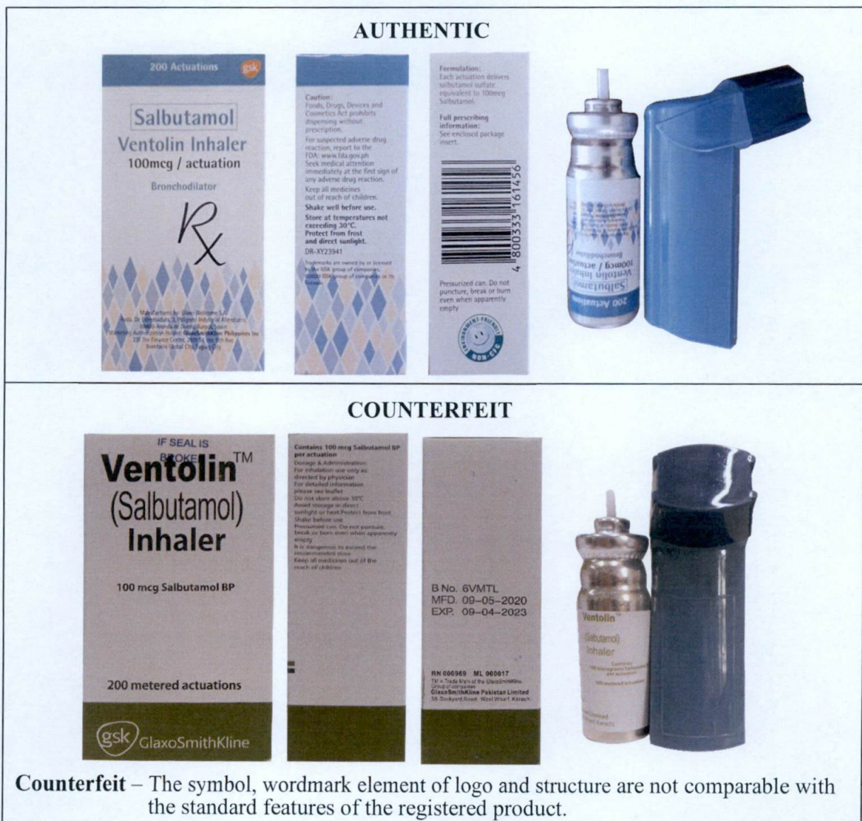
Figure 1. Comparison between the Authentic and Verified Counterfeit gsk Ventolin™ (Salbutamol) Inhaler 100 mcg Salbutamol BP 200 Metered Actuations (Batch No. 6VMTL)

The Food and Drug Administration (FDA) advises the public against the purchase and use of the counterfeit version of the following product: