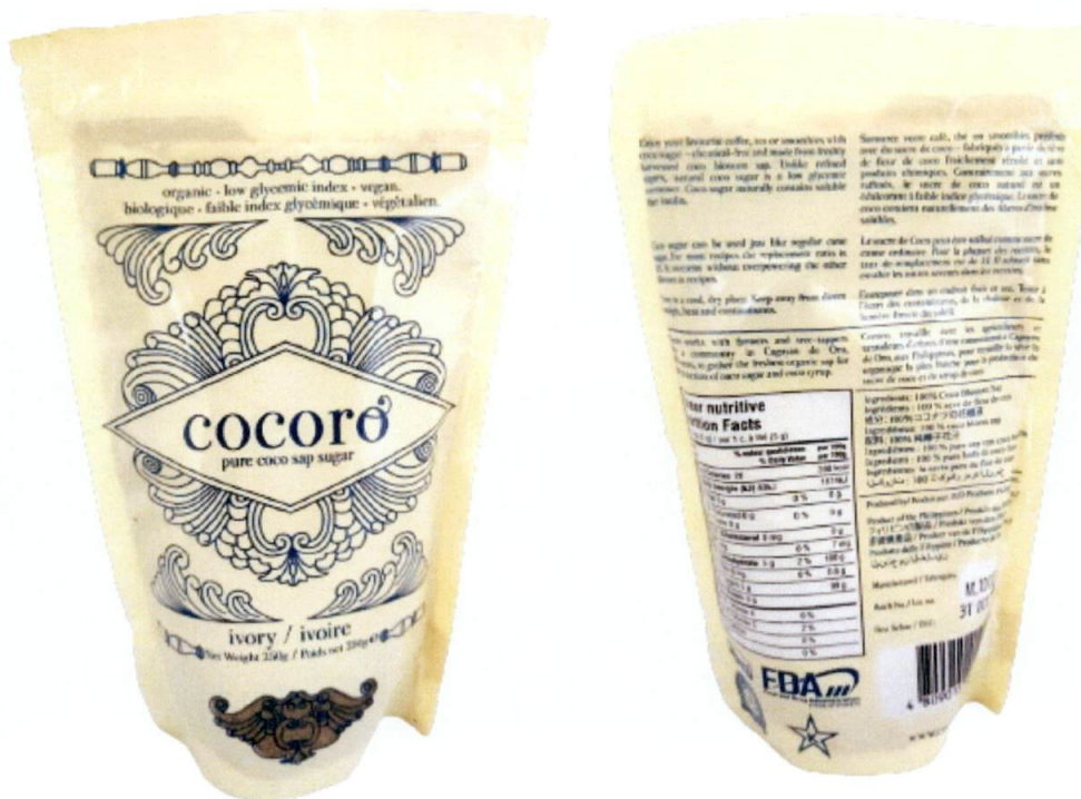
Figure 1. Unregistered COCORO Pure Coco Sap Sugar Ivory

The Food and Drug Administration (FDA) warns all healthcare professionals and the general public NOT TO PURCHASE AND CONSUME the unregistered food product: