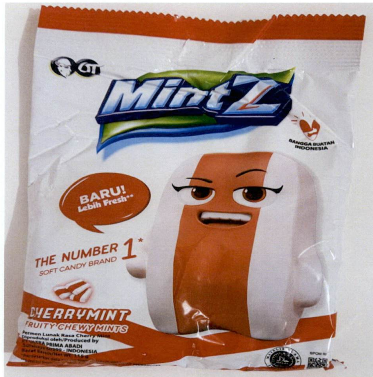
Figure 1. Unregistered MINTZ Cherrymint Fruity Chewy Mints

The Food and Drug Administration (FDA) warns all healthcare professionals and the general public NOT TO PURCHASE AND CONSUME the unregistered food product: