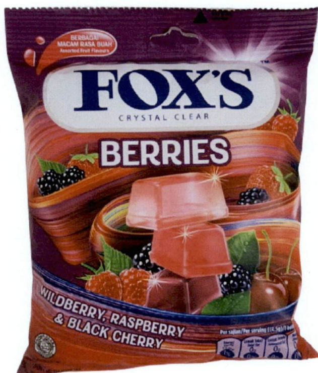
Figure 1. Unregistered FOX'S CRYSTAL CLEAR Berries - Wildberry, Raspberry & Black Cherry

The Food and Drug Administration (FDA) warns all healthcare professionals and the general public NOT TO PURCHASE AND CONSUME the unregistered food product: