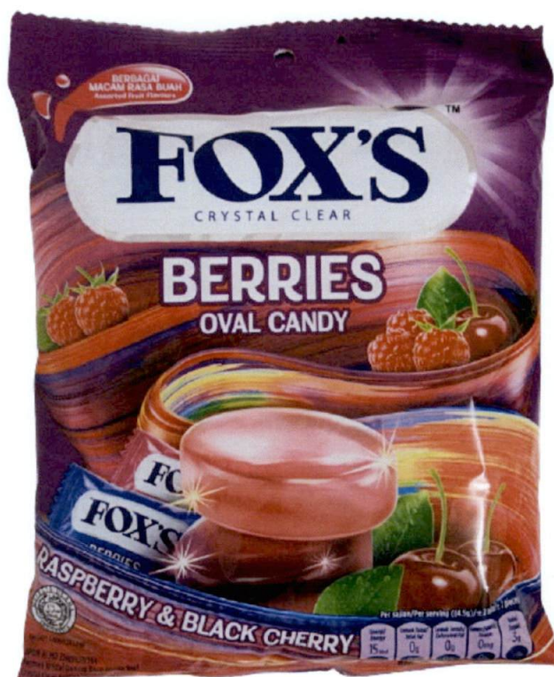
Figure 1. Unregistered FOX'S CRYSTAL CLEAR Berries Oval Candy- Raspberry & Black Cherry

The Food and Drug Administration (FDA) warns all healthcare professionals and the general public NOT TO PURCHASE AND CONSUME the unregistered food product: