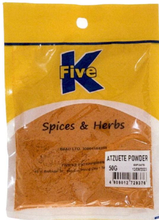
Figure 1. Unregistered FIVE K Atzuete Powder

The Food and Drug Administration (FDA) warns all healthcare professionals and the general public NOT TO PURCHASE AND CONSUME the unregistered food product: