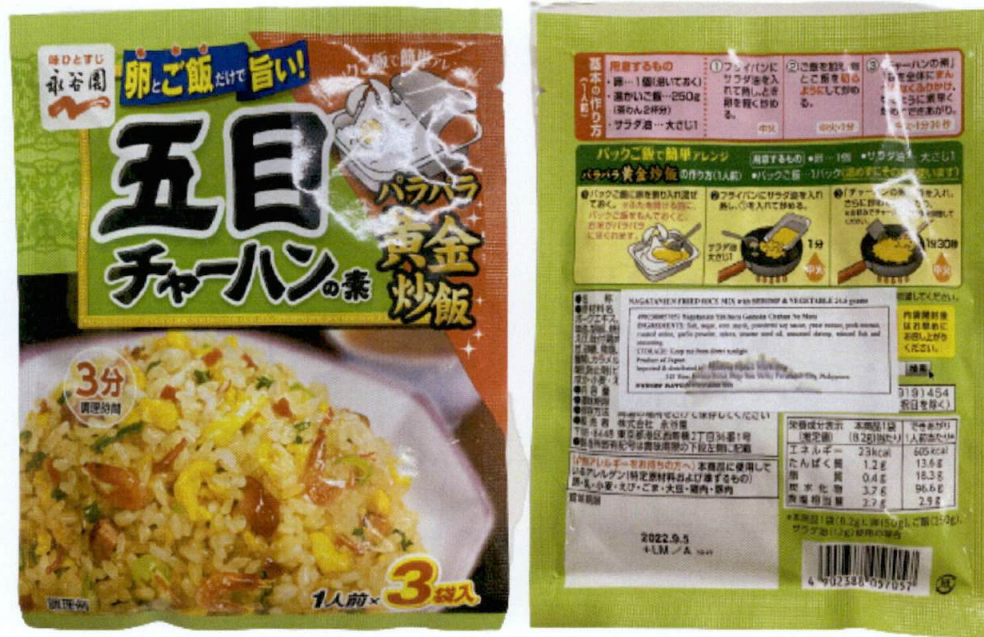
Figure 1. Unregistered NAGATANIEN FRIED RICE MIX WITH SHRIMP AND VEGETABLE

The Food and Drug Administration (FDA) warns all healthcare professionals and the general public NOT TO PURCHASE AND CONSUME the unregistered food product: