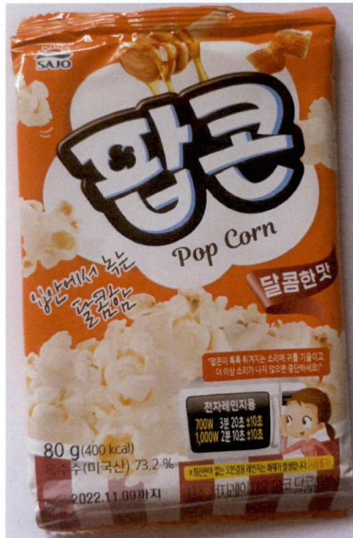
Figure 1. Unregistered SAJO Pop Corn with Honey in Red Packaging

The Food and Drug Administration (FDA) warns all healthcare professionals and the general public NOT TO PURCHASE AND CONSUME the unregistered food product: