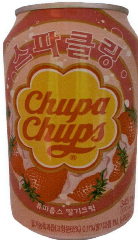
Figure 1. Unregistered CHUPA CHUPS (In Foreign Language)

The Food and Drug Administration (FDA) warns all healthcare professionals and the general public NOT TO PURCHASE AND CONSUME the unregistered food product: