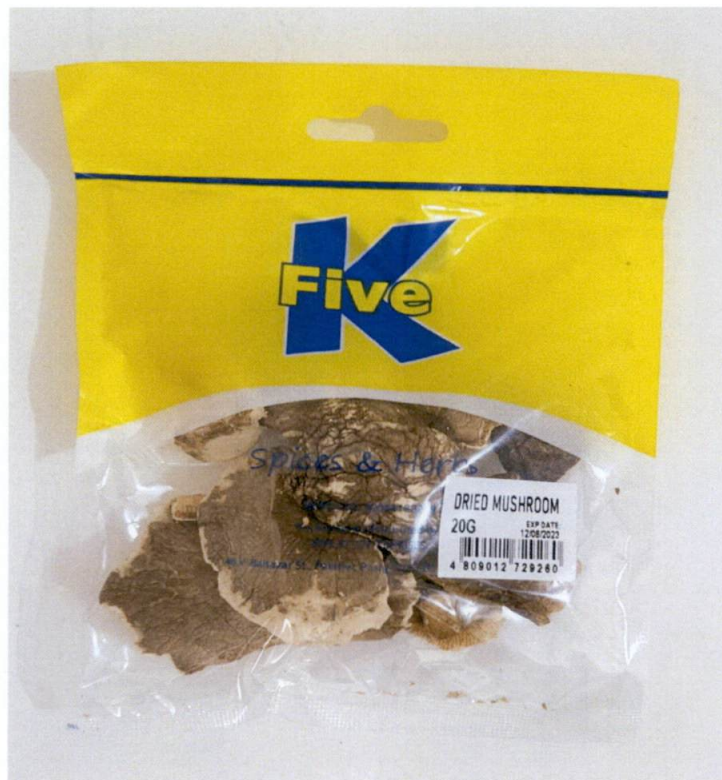
Figure 1. Unregistered K FIVE SPICES & HERBS Dried Mushroom

The Food and Drug Administration (FDA) warns all healthcare professionals and the general public NOT TO PURCHASE AND CONSUME the unregistered food product: