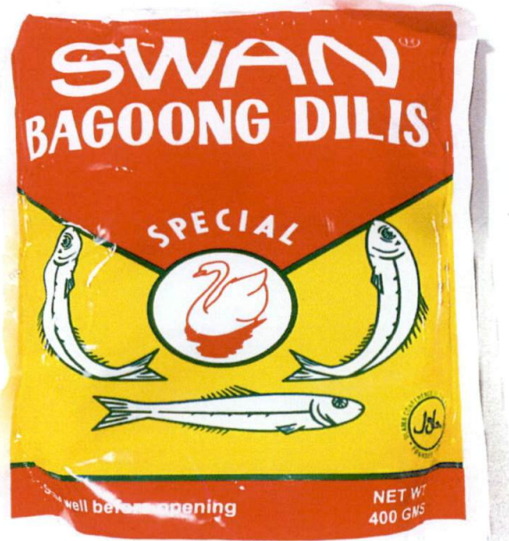
Figure 1. Unregistered SWAN Special Bagoong Dilis

The Food and Drug Administration (FDA) warns all healthcare professionals and the general public NOT TO PURCHASE AND CONSUME the unregistered food product: