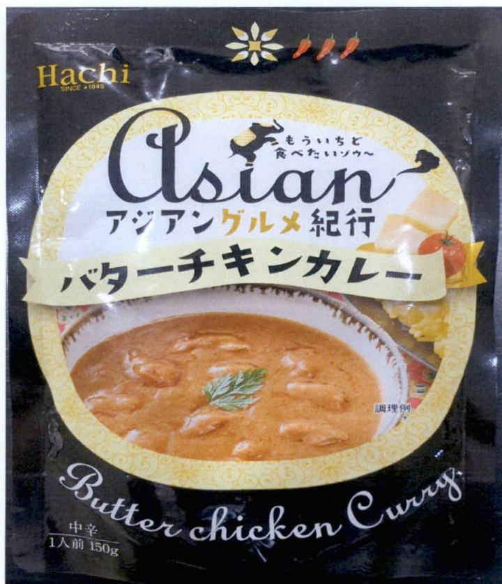
Figure 1. Unregistered HACHI Asian Butter Chicken Curry

The Food and Drug Administration (FDA) warns all healthcare professionals and the general public NOT TO PURCHASE AND CONSUME the unregistered food product: