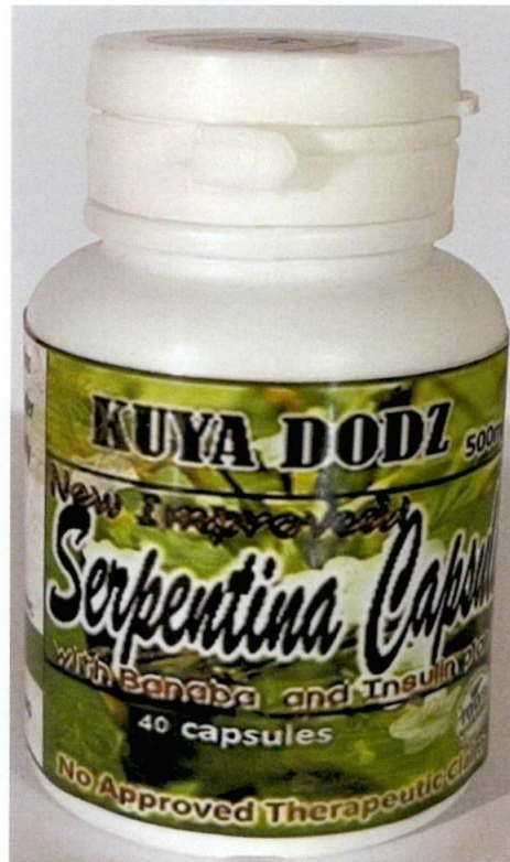
Figure 1. Unregistered KUYA DODZ Serpentina Capsule with Banaba and Insulin Plant 500mg

The Food and Drug Administration (FDA) warns all healthcare professionals and the general public NOT TO PURCHASE AND CONSUME the unregistered food supplement: